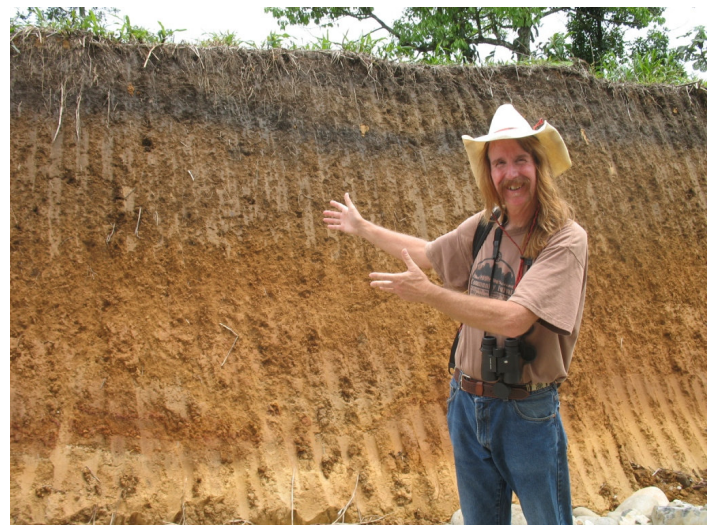
Soil Profile in the High Jungle Region of the Amazon near the Village of San Pedro (Note the buried "A" Horizon)...