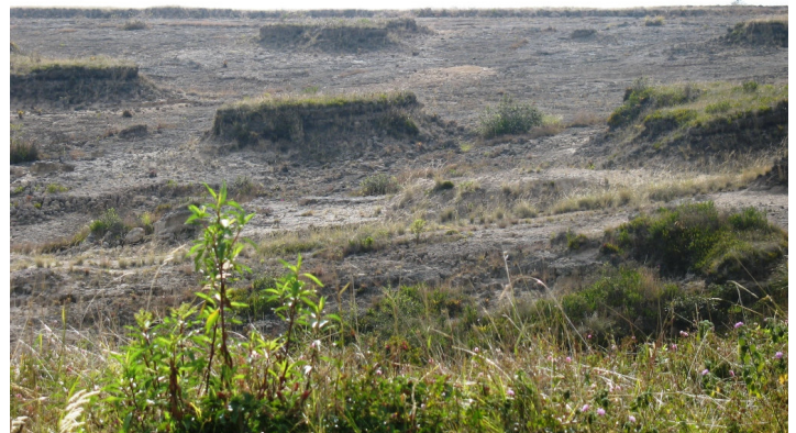
5269b ~ "Mass Wasting" of once highly fertile Volcanic Soil on what was once Cropland high in the Andes near the Village of Las Lajas